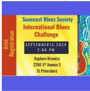
IBC Challenge Band Registration Fee $25.00