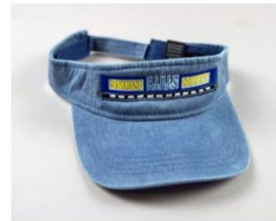
Suncoast Blues Society Logo Visor $25.00